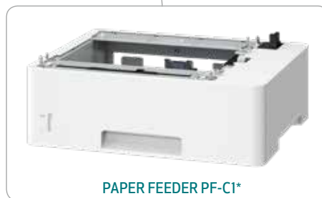
PAPER FEEDER PF-C1*